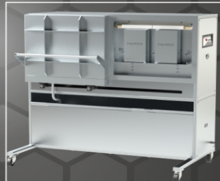
DOUBLE CHAMBER VERTICAL 500gm to 10kg