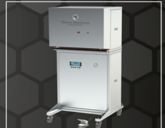
NOZZLE TYPE FOR API