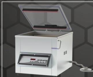
TABLE TOP JUMBO