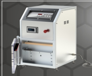
VACUUM PACKING WITH VALIDATABLE SEALING