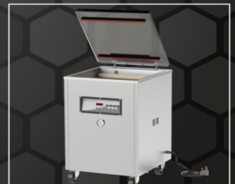
FLOOR MODEL (PH) 2