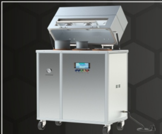
PRINTING INK TIN