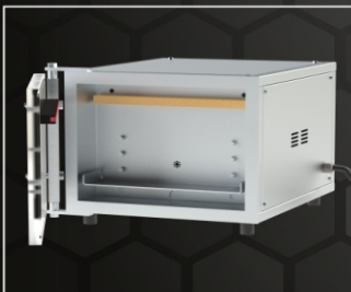
TABLE TOP VERTICAL