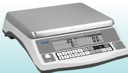
Piece Counting Scale