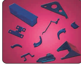
Sheet Metal Components