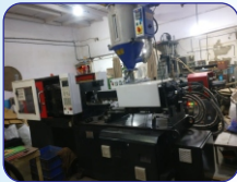
INJECTION MOULDING MACHINE 2