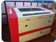
PLASTIC & ACRYLIC LASER CUTTING MACHINE