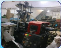
VERTICAL INJECTION MOULDING MACHINE