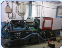
INJECTION MOULDING MACHINE 1