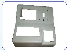
VACCUM FORMING SERVICES, ABS HIPS ETC MATERIALS