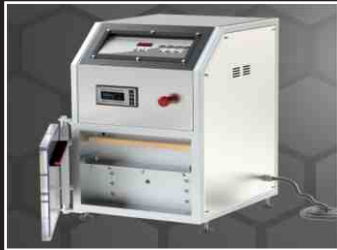
VACUUM PACKING WITH VALIDATABLE SEALING