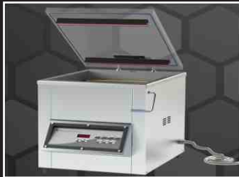
TABLE TOP JUMBO