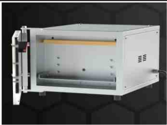
TABLE TOP VERTICAL