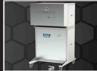
NOZZLE TYPE FOR API