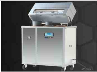
PRINTING INK TIN

TOTAL VACUUM SOLUTION & SPMs (Special Purpose Machines)