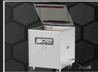
FLOOR MODEL (PH) 2

VACUUM SOLUTIONS & SPMs FOR ANY APPLICATION, INDIA'S ONLY VACUUM PACKING MACHINE WITH CE