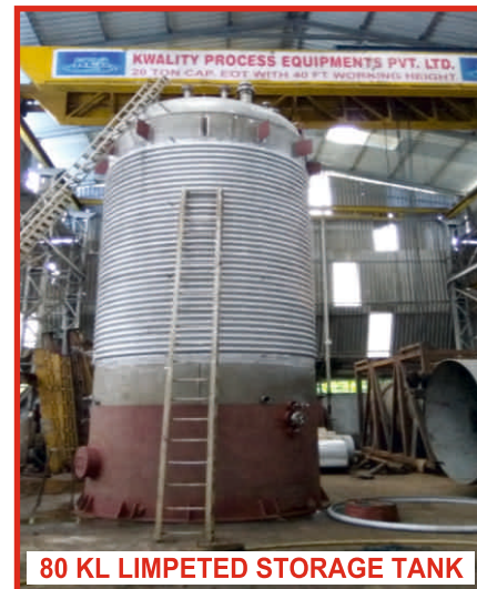
80 KL LIMPETED STORAGE TANK