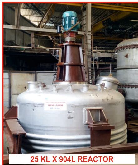
25 KL X 904L REACTOR