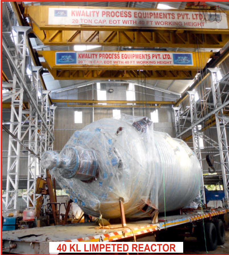
40 KL LIMPETED REACTOR

Mob.: 80079 91793 / 93246 23556 E-mail : info@chemicalequipments.com pdmakwana@chemicalequipments.com Website : www.chemicalequipments.com