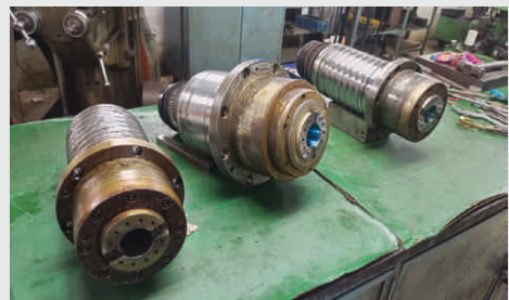
Spindle Overhauling & Reconditioning

Unit no.4, Dewan & Sons Ind. Estate No.7, Navghar, Vasai (E), Dist.: Palghar - 401202, Maharashtra