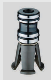
Collet (Gripper) repair