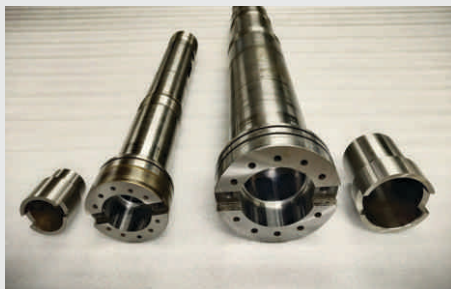
Hardened Bush Insertion