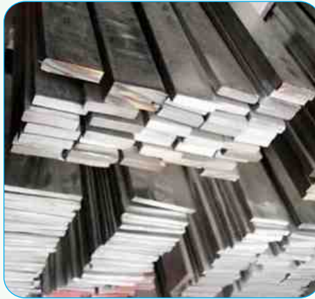
MS BRIGHT BARS