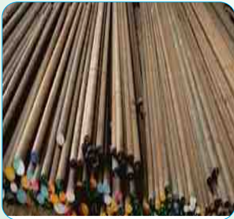
MS ALLOY STEEL